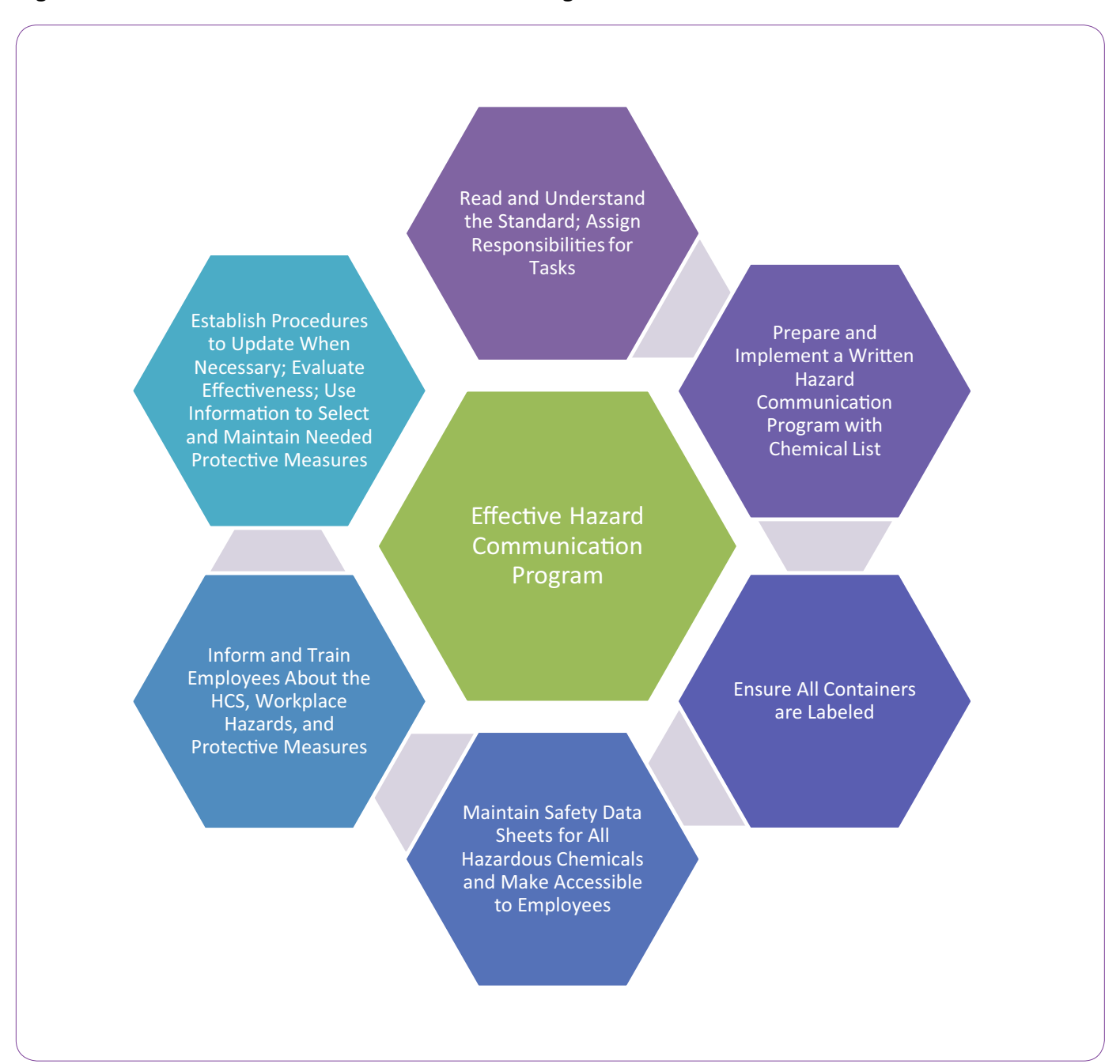
Figure 6: An Effective Hazard Communication Program

to address these hazards, employers can achieve many benefits for themselves, as well as for their exposed workers. HazCom 2012 provides the framework for building a chemical safety and health management program in a workplace. Figure 6 illustrates the steps that have been discussed to ensure that a workplace hazard communication program is effective.